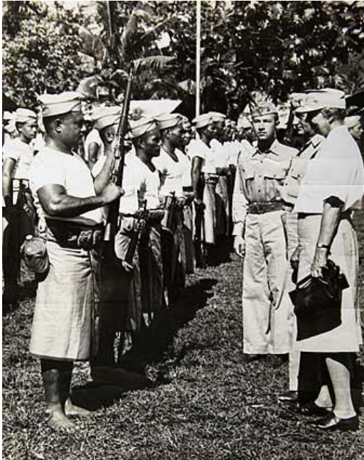
First Lady Eleanor Roosevelt visited American Samoa Marines in 1943.

3. Please do not remove photos from protective mylar sleeves or acid-free envelopes.